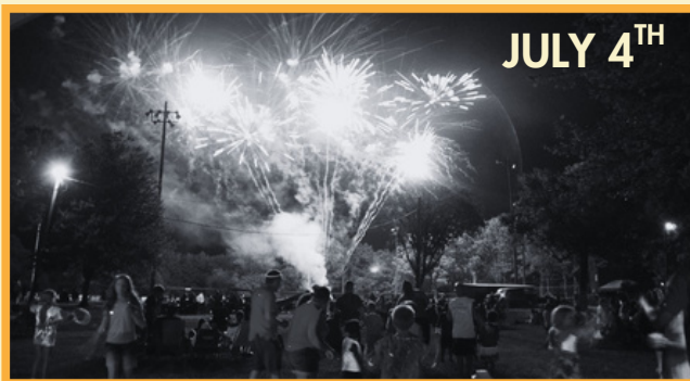
THE event of the year in Sheridan!

2026 marks the 250th anniversary of America's independence! Contributions will help us pay for festival entertainment and a memorable fireworks show. This year's theme Generations of Independence: Sheridan Through the Years.