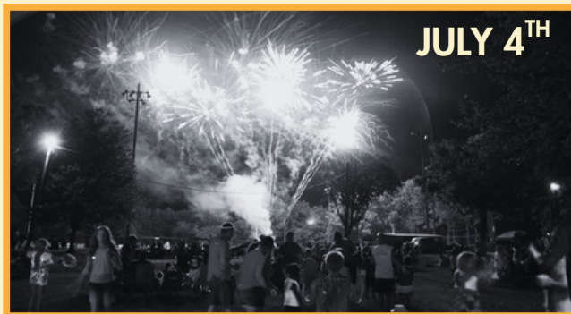
THE event of the year in Sheridan!

2026 marks the 250th anniversary of America's independence! Contributions will help us pay for festival entertainment and a memorable fireworks show. This year's theme Generations of Independence: Sheridan Through the Years.